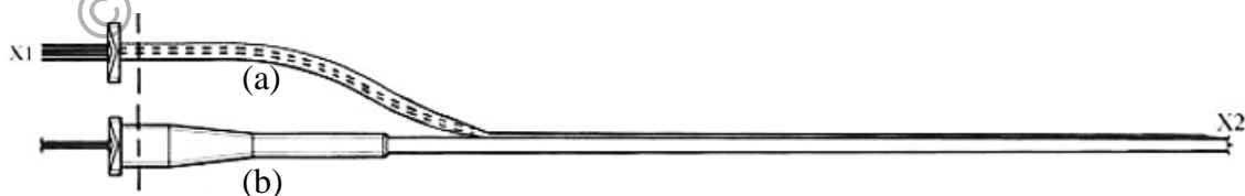
Figure 1.3: (a) Side arm, and (b) Former (Fathullah et al., 2010)