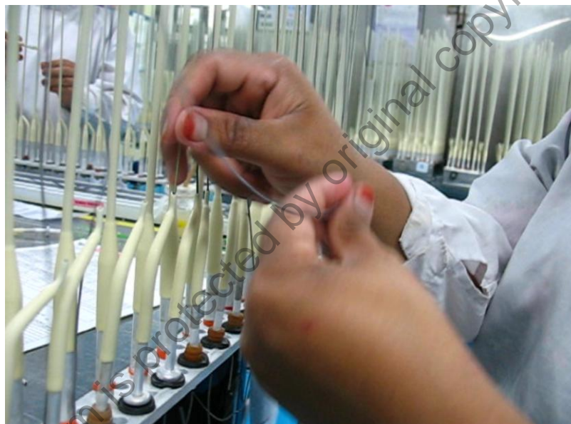
Figure 1.2: Threading process on side arms

solution called METHCELL. Then, the former-side arm catheter mould is dipped into latex where this particular process is called latex dipping process. The process is then followed by the curing at 60 °C which is aimed to dry the latex coating surrounding the rubber thread and the former-side arm mould. Later, the coating of latex becomes hardened around the rubber thread and former-side arm mould. This hardened latex coating is actually known as catheter. The catheter then finally pulled out from the former-side arm mould (Fathullah et al., 2010).