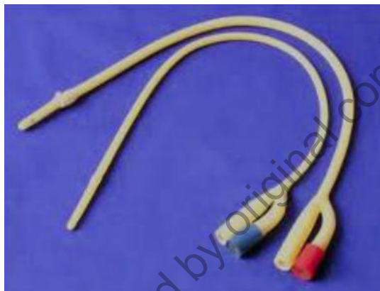
Figure 1.1: Indwelling catheter (Fathullah et al., 2010)

depleting the urine is done by inserting the tube into the bladder through a duct called urethra and then the catheter is allowed to stay within the bladder. The catheter is extensively demanded globally and practically applied by trained medical specialist and surgeons. There are three common types of catheter which are straight, indwelling and suprapubic catheters (Fathullah et al., 2010). The example of indwelling catheter is shown in Figure 1.1.