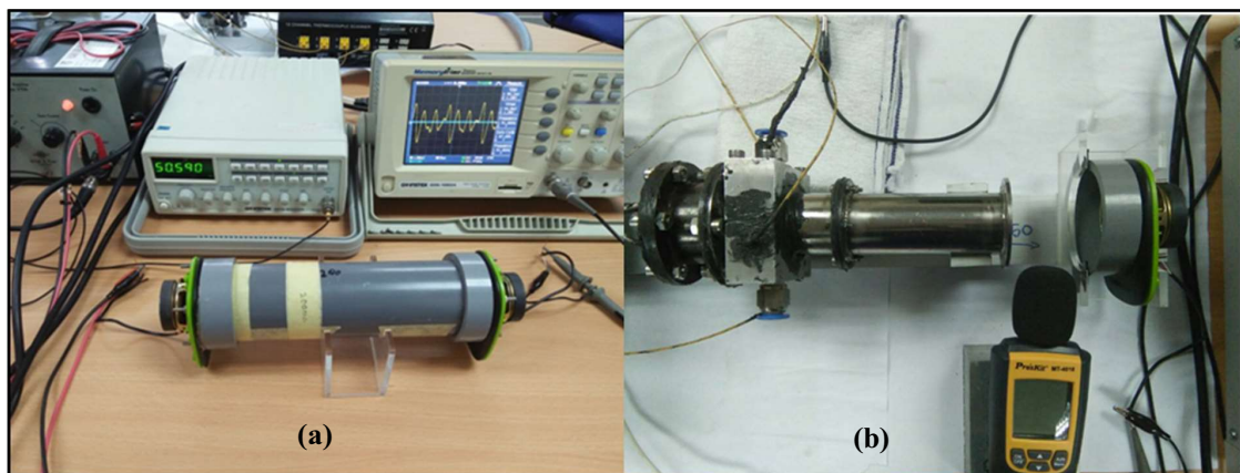
Figure 1. (a). Experimental setup for measuring Voltage, Vpp and Output frequency, Hz (b). Experimental setup with Thermoacoustic Heat Engine for measuring frequency, Hz and decibel dB.