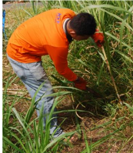
Figure 1.2: The conventional Napier harvesting using a machete.

pain. Furthermore, biomechanical load handling might cause high stress on lower extremity region.