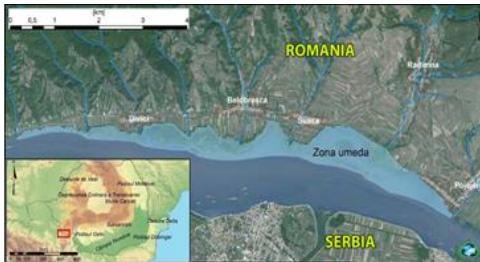
Figure 2. Location Divici-Pojejena [3].

Divici-Pojejena wetland is located on the left bank of the Danube, after the river is entering Romania. This area is the result of the increased water levels of the Danube, after the construction of Hydroenergy and Navigation System Iron Gates I, covering an area of 440 ha on the administrative territory of Pojejena commune, within Caraş-Severin county (figure 2). Divici-Pojejena wetland is an important region, due to the fact that in 2004, through its inclusion in the Iron Gates Natural Park, it was declared a wetland of international importance - Ramsar site [15].