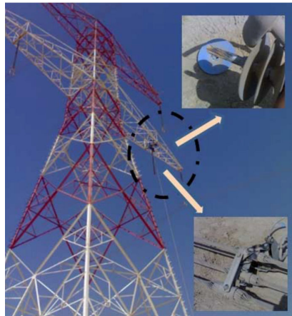
Figure 2. Failure a 400kV overhead line in Gulf region [4]

Nowadays, most of the substation and transmission in China have been covered with RTV silicone rubber coated in voltage range 10 kV to 500 kV. The first generation of RTV coated insulator have been in service for 15 years and more without flashover and maintenance even there were heavy fog occur in 1987, 1992 and 2001 [6].