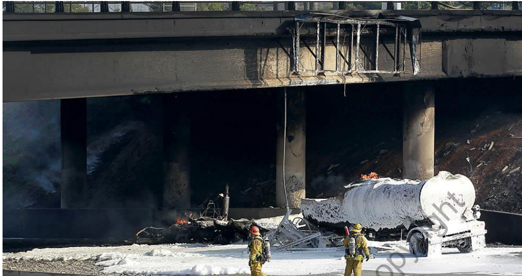
Figure 2.1: Tanker truck exploded beneath the 60 Freeway in California which caused damage to overhead bridge (LA Times, 2011).