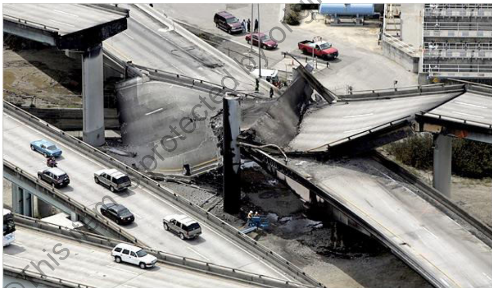
Figure 2.2: Collapsed freeway overpass near San Francisco, California (New York Times, 2007)

Fire hazard in bridges typically involves petrol fires (Garlock et al., 2012). In Table 2.1, Garlock et al. (2012) listed major bridge fires in United State of America from 1995 until 2009. Most of the fire damage involved gasoline tanker crashing or over-turned. This is obvious as the road infrastructure serves major traffic and tankers