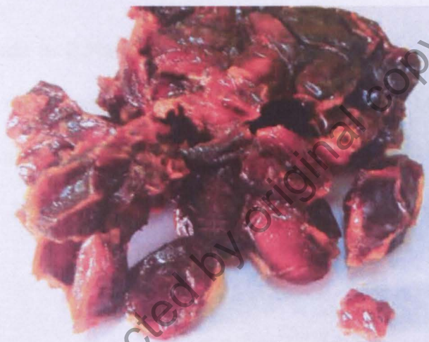
Figure 2.1: Date fruits

The date fruit is a rectangle, one-seed berry, with a fat and sweet pericarp (Fig. 2.1). Dates differ very much in size ranging from 18 to 110 mm long, weighing from 2 to 60 g per date, and the hues ranging from yellow to black. The date seed (also called hollow, stone or seed) is hard coated, oblong and weighs 0.5 to 4g (Zaid et al., 2002).