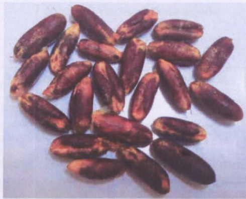
Figure 2.2: Date seeds